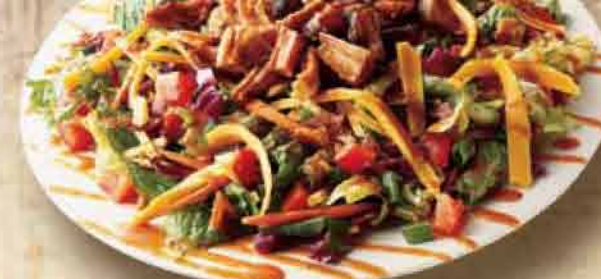
Dave's Sassy BBQ Salad

Vanilla bean ice cream drizzled with hot fudge or pecan praline sauce and topped with whipped cream. 5.49