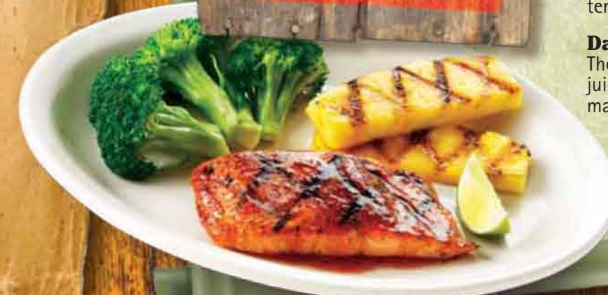
Citrus Grilled Salmon

Natural cuts vary in calories based on portion size.