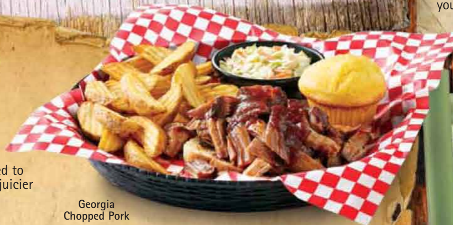
Georgia Chopped Pork

A real mouthful of hollers! Twelve ounces of hot link sausage best served with an ice-cold beer to douse the flames. 13.49