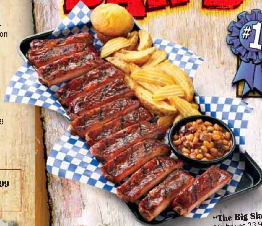
"The Big Slab"

Dave's version includes Wilbur Beans, Famous Chili, jalapeños, Rich & Sassy® and your choice of Texas Beef Brisket, Georgia Chopped Pork or Barbeque Pulled Chicken. Nachos Grande 11.99 Nachos for Two 7.99