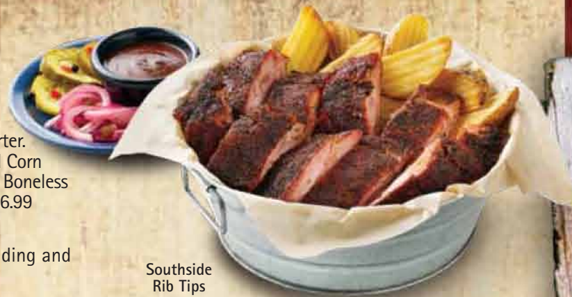
Southside Rib Tips

Dave's fresh-made chips loaded with jalapeño bacon and diced tomatoes, topped with tangy bleu cheese dressing and crumbles. 6.49