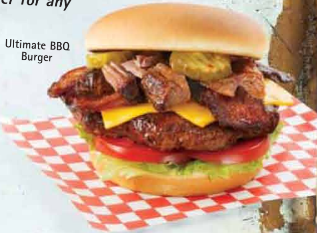
Ultimate BBQ Burger

A juicy ground beef patty beneath a pile of Georgia Chopped Pork with two strips of jalapeño bacon, melted sharp American cheese and our signature Beam & Cola BBQ sauce. 10.49