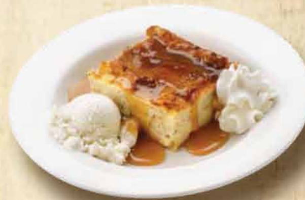
Dave's Famous Bread Pudding